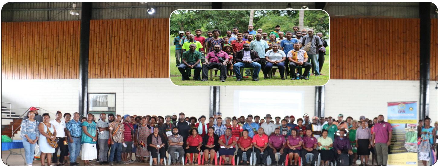
Participants expressed satisfaction after the awareness session held at the Sir Ignatius Stadium indoor complex in Lae and gathered for a photoshoot. Insert: Participants with the IPA team during the awareness at Mutzing Station of Markham District, Morobe Province