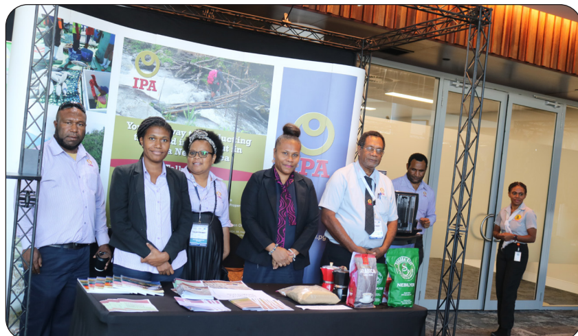
IPA team at the booth