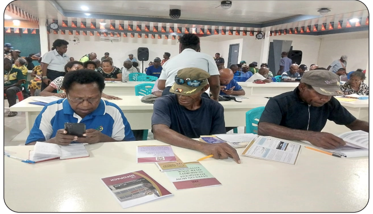
IPA doing one-on-one sessions on Online Registry System (ORS) with participants during the awareness in Vanimo