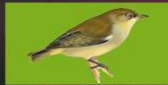
Illustration from Dick Watling book - A Guide to the Birds of Samoa and Western Polynesia, 2001 Ma'afu'afu - Samoan White-eye ( Zosterops samoensis ), only found in the uplands of Savaii.