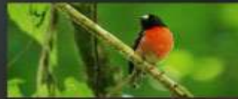
Photo: W. Rebecca Zimmerman Tolazula - Scarlet Robin ( erodica multicolor ), only found in Samoa.