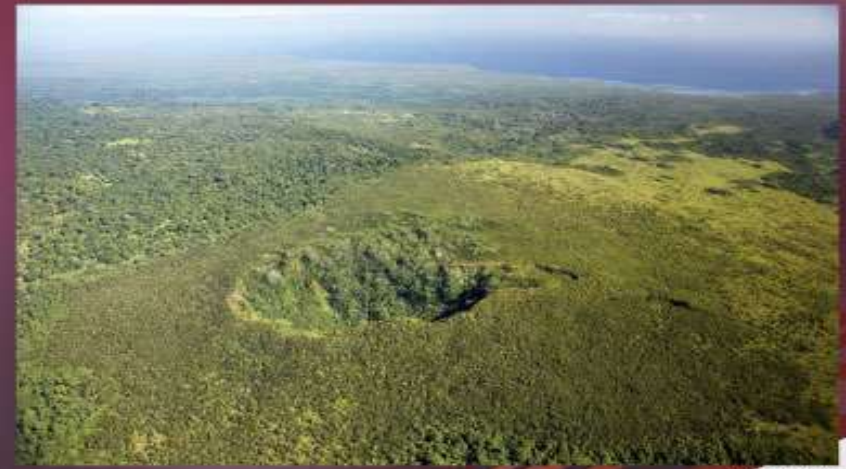
Aerial view of Mt Matāvanu Crater looking northwest.